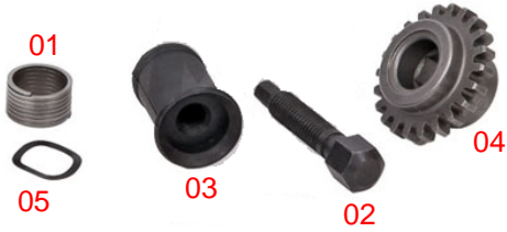
2244 - D3 TYPE Caliper Repair Kit (Left)