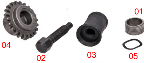
2245 - D3 TYPE Caliper Repair Kit (Right)