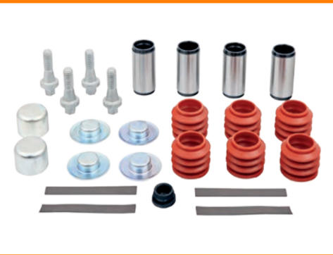
4023 - MARK II-III (2-3) TYPE Caliper Guide & Seals Repair Kit