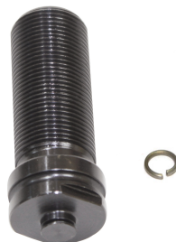
4006 - MARK II-III (2-3) TYPE Caliper Calibration Bolt (Piston Version)