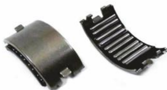
4002 - MARK II-III (2-3) TYPE Caliper Roller Bearings