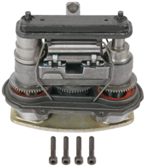
4046 - MARK II-III (2-3) TYPE Caliper Mechanism, Piston & Cover Kit