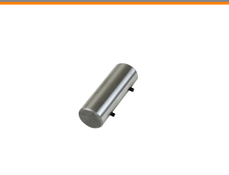
4033 - MARK II-III (2-3) TYPE Caliper Lever Pin