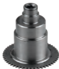
4020 - MARK II-III (2-3) TYPE Caliper Adjustment Sleeve (Driving)