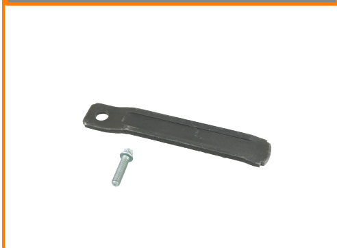
4032 - MARK IV (4) TYPE Caliper Pad Retainer Repair Kit