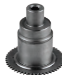
4019 - MARK II-III (2-3) TYPE Caliper Adjustment Sleeve (Driven)