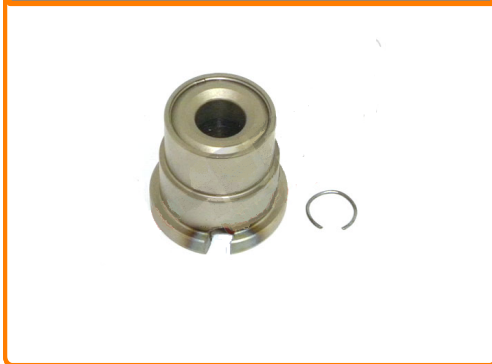
4027 - MARK II-III (2-3) TYPE Caliper Adjusting Mechanism