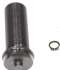
4004 - MARK II-III (2-3) TYPE Caliper Calibration Bolt (Push plate Version)