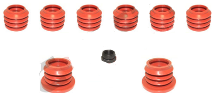
4007 - MARK II-III (2-3) TYPE Caliper Dust Covers & Seals Repair Kit