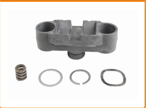
4031 - MARK II-III (2-3) TYPE Caliper Bridge Assembly Repair Kit