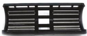
4001 - MARK II-III (2-3) TYPE Caliper Roller Bearing