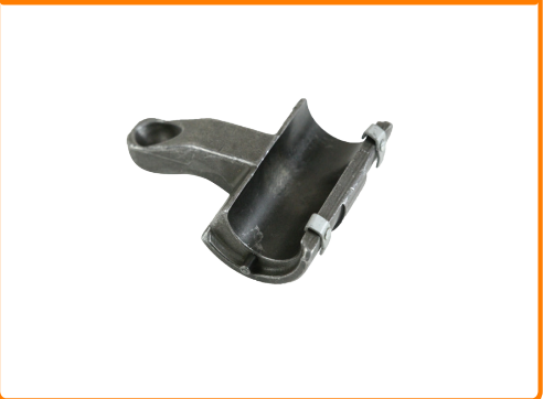
4026 - MARK II-III (2-3) TYPE Caliper Lever