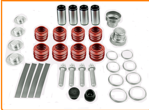
4022 - MARK II-III (2-3) TYPE Caliper Guide & Seals Repair Kit